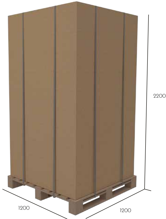
FULL PALLET: MAX WEIGHT 1250KG

For the smallest of deliveries, we offer a courier service with pump truck and tail lift offload. This service has a 1-tonne weight restriction. Their designated size and weight limitations are as follows: