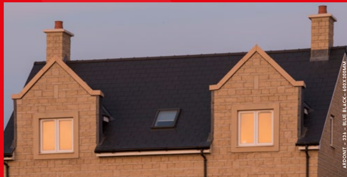
ARDONIT - 336 - BLUE BLACK - 600X300MM

The Ardonit textured slates have a textured surface with a square edge. The slate has squared edges which makes it easier to place. This Ardonit slate comes close to the look of the natural slate and is available in the colour blue-black. The slates also have a nominal thickness of 4 mm and are available in the 600x300 mm and 600x600 mm format.