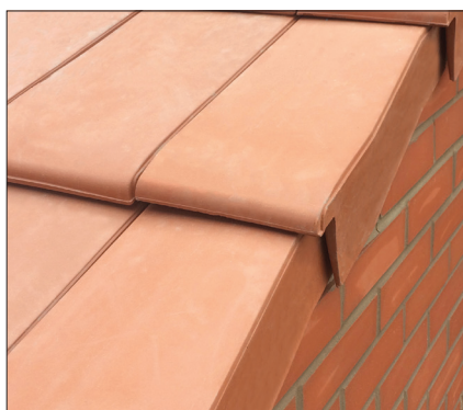
Crest Nelskamp & RDUK clay right hand cloaked verge.