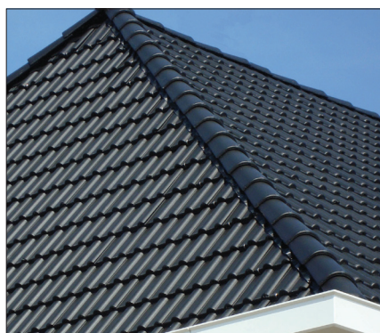
Crest Nelskamp & RDUK Dry Fixing System.

*As per European trademark Nr.7287956, filed on 2nd October 2008, the Trademark PLANUM belongs to La Escandella. It is Dachziegelwerke Nelskamp as authorized licensee of the owner allowed to use the mark PLANUM for its concrete product.