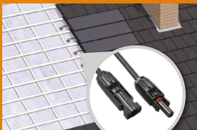
Tiles are supplied with simple to use standard "Plug In" MC4 connectors

The simple and quick installation makes the solar roof tile ideal for both new build and renovation projects.