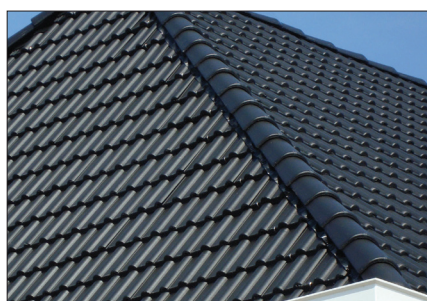
RDUK Dry Fixing System.

*As per European trademark Nr.7287956, filed on 2nd October 2008, the Trademark PLANUM belongs to La Escandella. It is Dachziegelwerke Nelskamp as authorized licensee of the owner allowed to use the mark PLANUM for its concrete product.