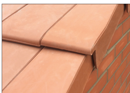
RDUK clay right hand cloaked verge.